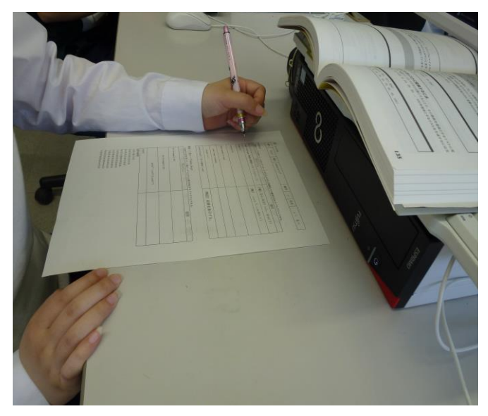
Fig. 3: Scene of bidirectional transcription learning

A scene of bidirectional transcription learning is shown in Fig. 3. Here a student is trying to write an explanation of the program listed on the "Bidirectional transcription (front)" worksheet, while referring to the textbook and other resources.