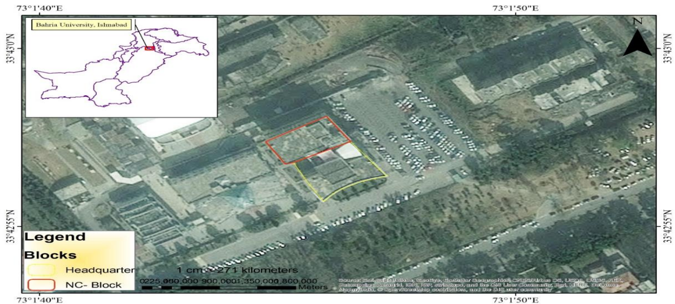
Figure 1: Study Area Map

The system type that has been proposed for new campus is hybrid of grid and solar PV (on grid system). This system is likely to ensure complete compliance and adequacy to the design parameters. The offered system has been designed based on the current irradiance. The shaded area of the roof is excluded, inverters to be mounted beneath the mounting structure, azimuth is 0 degrees and tilt is 21 degrees