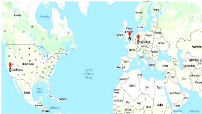
Figure 3: Geographic Distribution of our experiment.