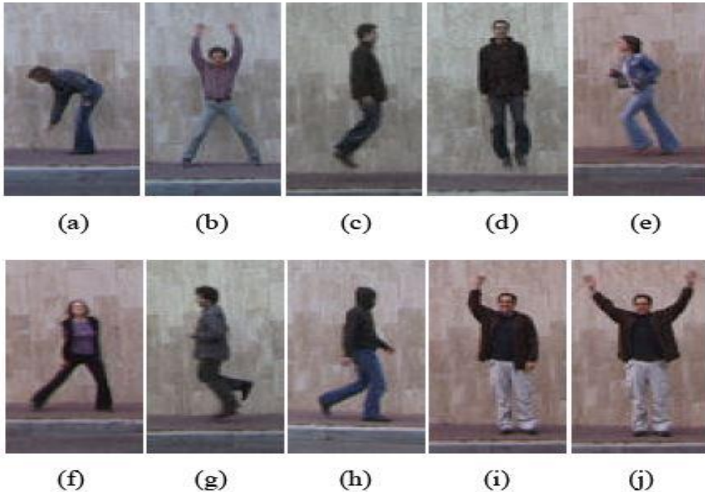
Figure 2. Sample frames from the dataset contain that 10 actions of 9 persons consist of (a) bend, (b) jack, (c) jump, (d) jump, (e) run, (f) side, (g) skip, (h) walk, (i) wave1, (j) wave2

For training, we use 2/3 of the dataset and the rest for testing. During our experiment, we randomly select six sequences in each action as a training set and the rest for testing.