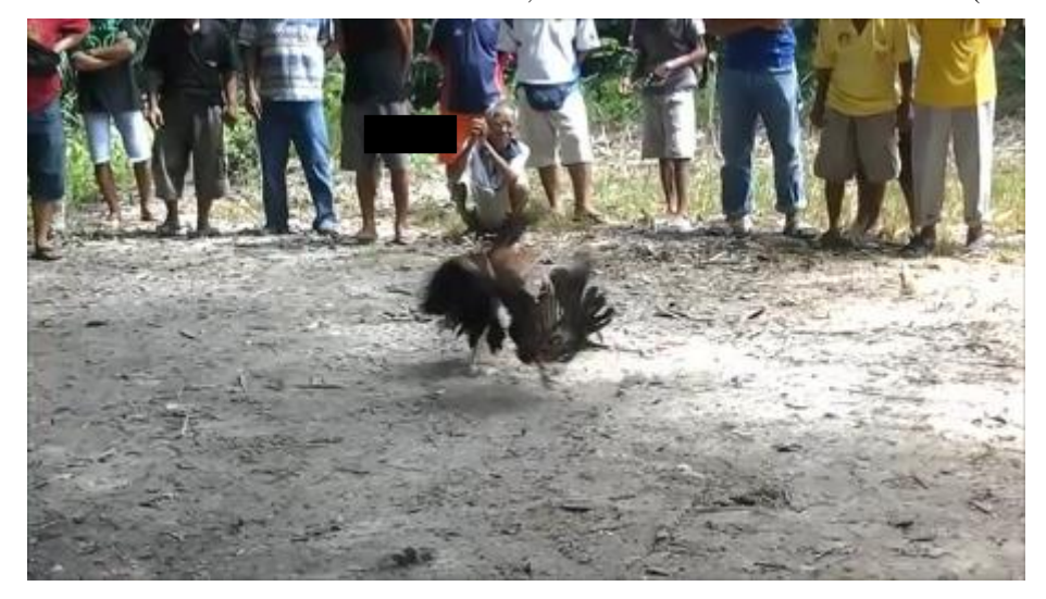
Figure 2: Cockerels fights with each other (nyabung ayam)