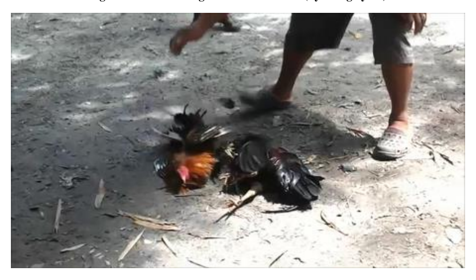
Figure 3: The winner and loser at the end of the fight