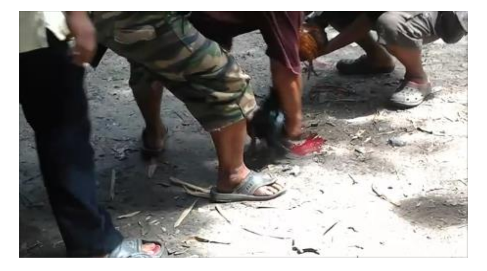
Figure 4: Blood from one of the cockerels because of the use of taji % \frac{1}{2}