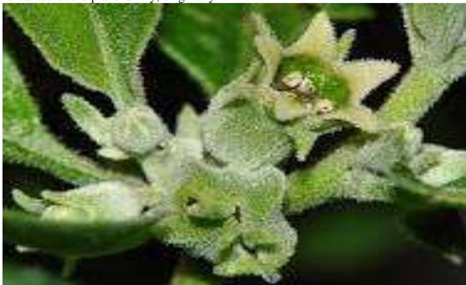
Figure-5. The general image of the plant of Withania Coagulans .

The general image of the plant of Withania Coagulans is given below in Figure-5