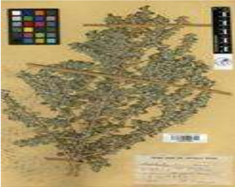
Figure-2. The general image of the plant of Forskholea Tenacissima . Solanum Nigrum .

The general image of the plant of Forskholea Tenacissima (Local Name , Chaha Mahak ) is given below in Figure-2