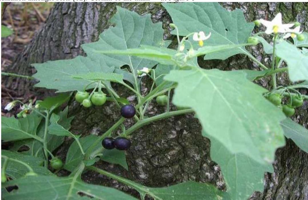
Figure-3. The general image of the plant of Solanum nigrum

sorts inside the complex of Solanum Nigrum are: Solanum Nigrum , Solanum Americanum , Solanum Douglasii , Solanum Apacum , Solanum Ptychanthum , Solanum Retroflexum , Solanum Sarrachoides , Solanum Scabrum and Solanum. Villosum . The overall picture of the plant Solanum Nigrum (Local Name, Tola Angur ) is given below in Figure-3