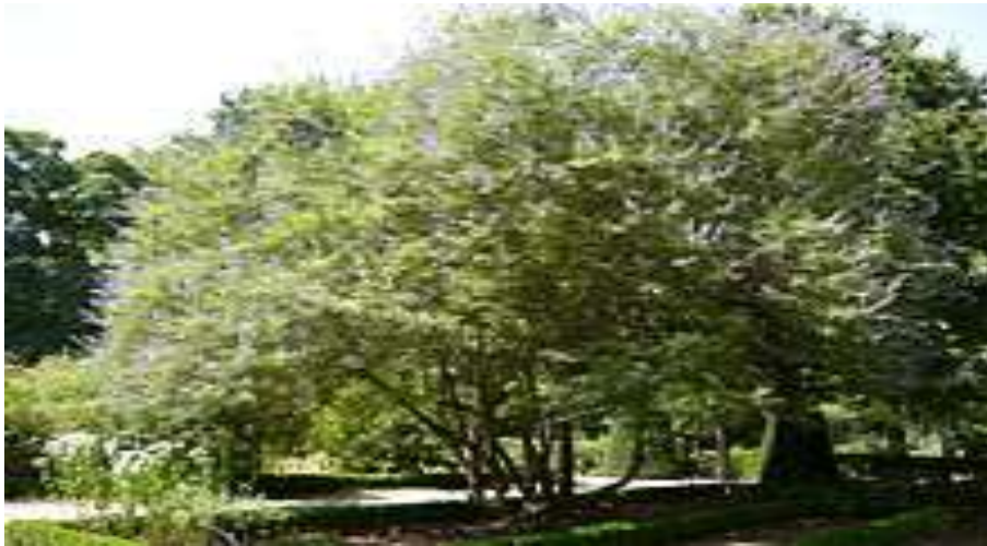
Figure-4. The general image of the plant of Vitex Agnus-Castus .

Theophrastus mentioned many times Bush, as Agnos, the research in flora. Vitex , its title in "Pliny the Elder", vieo comes as of Latin , to knit or bond, a mention to the usage of wicker Vitex Agnus-Castus [17]. Repeats it's specific name macarrónico "caste" in Greek and Latin , and reflected sacred to the divinity Hestia / Vesta. The general image of the plant of Vitex Agnus-Castus is given below in Figure-4