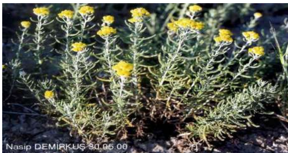
Figure-1. The general image of the plant of Achillea Wilhelmsii .

The general image of the plant of Achillea Wilhelmsii (Local Name, Boe Madran ) is given below in Figure-1