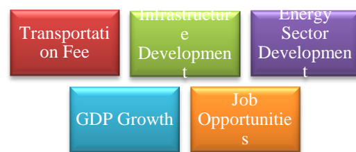
Figure 1: Five Economic Impacts of CPEC

factors and aspects included in this project will have an indirect or direct impact on the economy of Pakistan. Before the initiation of CPEC project the volume of trade between China and Pakistan was already increasing gradually and with the introduction of CPEC project this volume is expected to rise rather significantly [7]. This rise represents a key impact on the economy of Pakistan and many experts have affirmed that CPEC will transform the economy of Pakistan. The completion of Gwadar International Airport is a major factor which will portray positive impacts on the economy of Pakistan and it will be completed by the end of year 2017. The magnitude and scope of this project is such that its value is highly expected to surpass the entire foreign direct investment made in Pakistan. Another significant economic impact of CPEC will be in the form of generating job opportunities i.e. CPEC will be producing more than 600,000 direct jobs within the time frame of 2015 and 2030 which will drive the growth rate of the country in an effective manner [8].