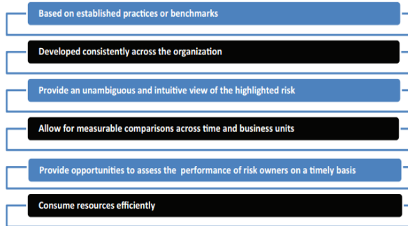
Figure 3: Expected Responsibilities of Boards of the Organization

involvement. This is a matter of interest, as it seems to be in conflict with the fundamentals of agency theory considerations whereby decision-making control is the basic and sole responsibility of the Board of Directors of an organization