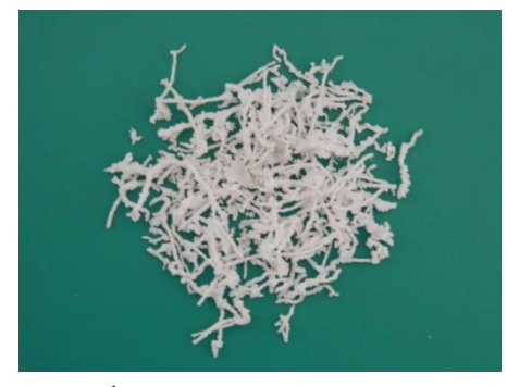
Fig # 1: PMMA sheet drilled threads

The length of these curves could also gives relative concentration of the different grain sizes in a sample.Qualitative estimation about the size groups of plastic particle in a sample could be made until the surface of the solvent turns to thin solid membrane and the rest of the solution as a very thick semi liquid, fig # 4. The limit of estimating plastic particle sizes using this simple method could be increasesd by using less volatile solvents.