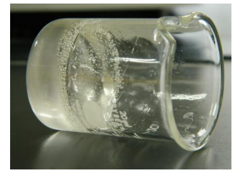
Fig # 4: PMMA viscous solution at 120 minute of reaction

When this layer of finest plastic particle dissolves, the solvent regain larger surface area for its evaporation, and hence evaporation rate increases . Another layer of swelled plastic particles of comparatively larger sizes rose to the surface, and again the evaporation rate of the solvent reduces. In this way particles of larger sizes, in groups, forms layers on the solvent surface, thus giving successive intervals of increasing and decreasing evaporation rates of the solvent. The interval between two successive high evaporation regions in the evaporation graph indicates a group of particles of approximately same sizes.