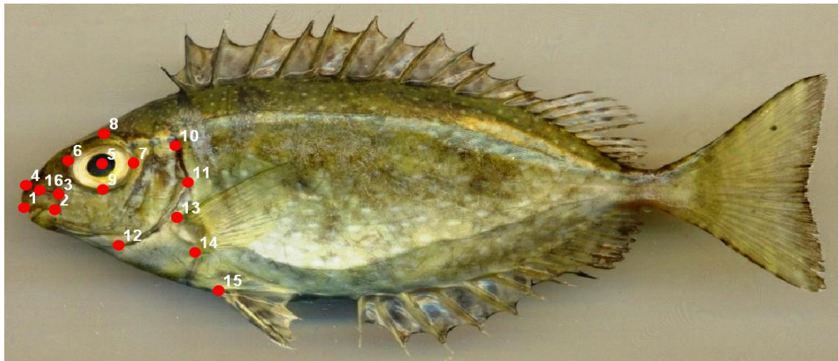
Figure 2. The locations of the landmarks used for the FA analyses. (1) Lower anterior of the premaxilla (2) Lower posterior of the premaxilla (3) Upper posterior of the premaxilla (4) Upper anterior of the premaxilla (5) Center of eye (6) Anterior margin through the midline of the eye (7) Posterior margin through the midline of the eye (8) Superior margin of the eye (9) Inferior margin through the midline of the eye (10) Dorsal-lateral angle of the operculum (11) Posterior margin of the operculum (12) Isthmus (13) Origin of pectoral fin (14) Insertion of pectoral fin (15) Origin of pelvic fin (16) Mid-superior margin of the upper lip.